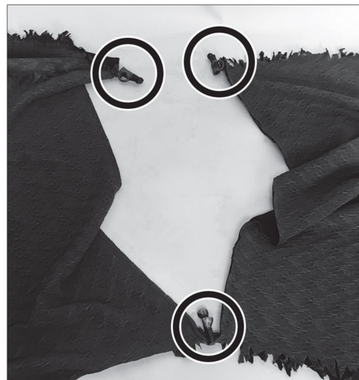
3. The drapery has (3) connection points and can be displayed with either color facing out.