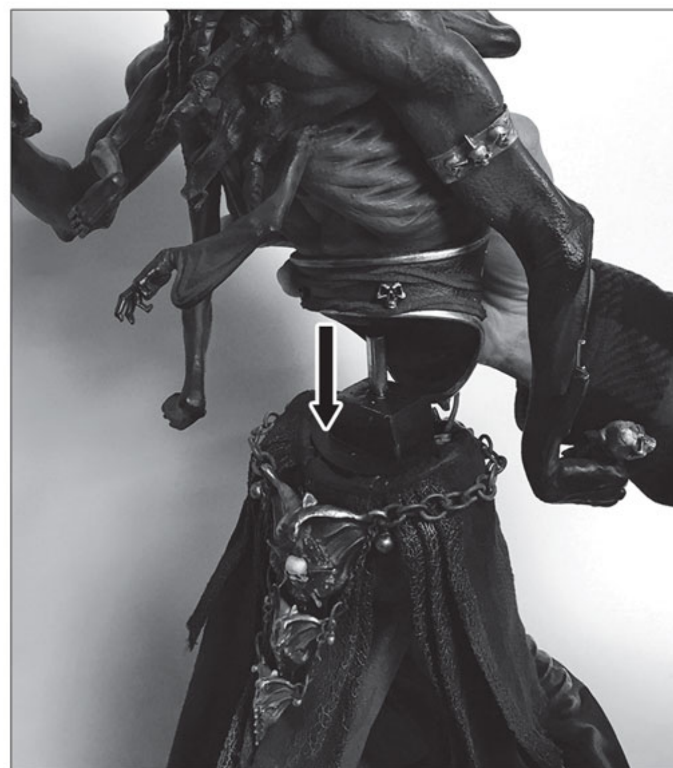
2. Bring the upper torso over the waist, and fit the peg into the hole as shown above.