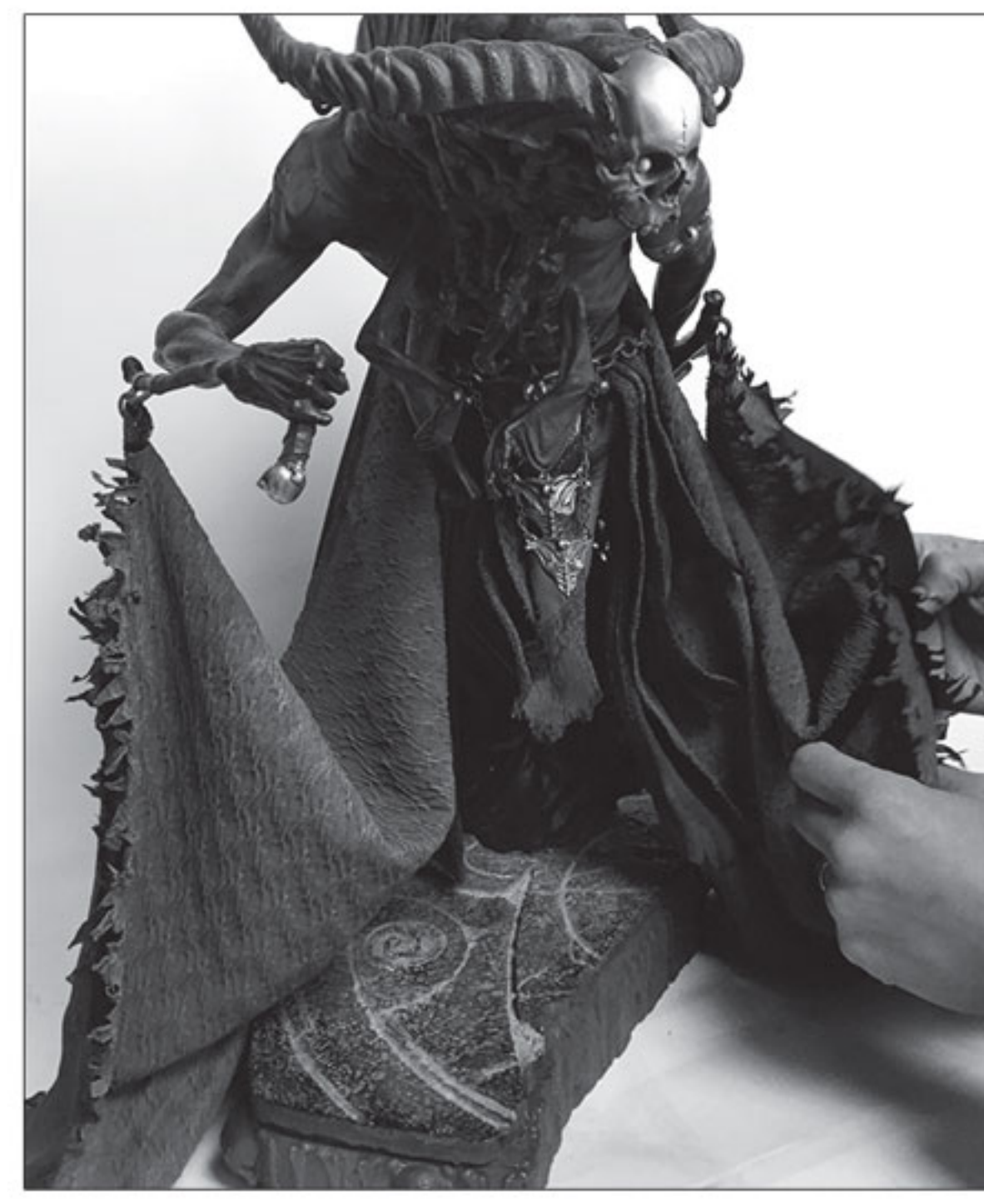
7. Adjust the hanging drapery to desired look, making sure it is not caught on any parts.