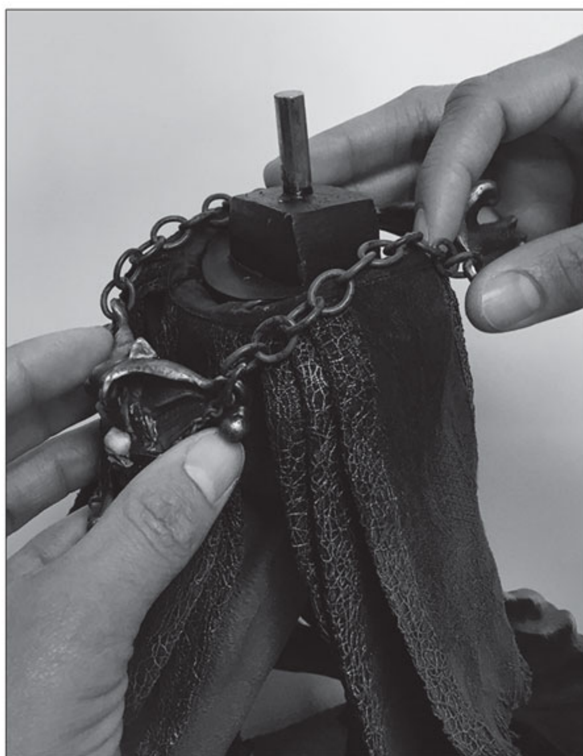
1. Place the chained belt over the waist, making sure it does not obstruct the upper torso.