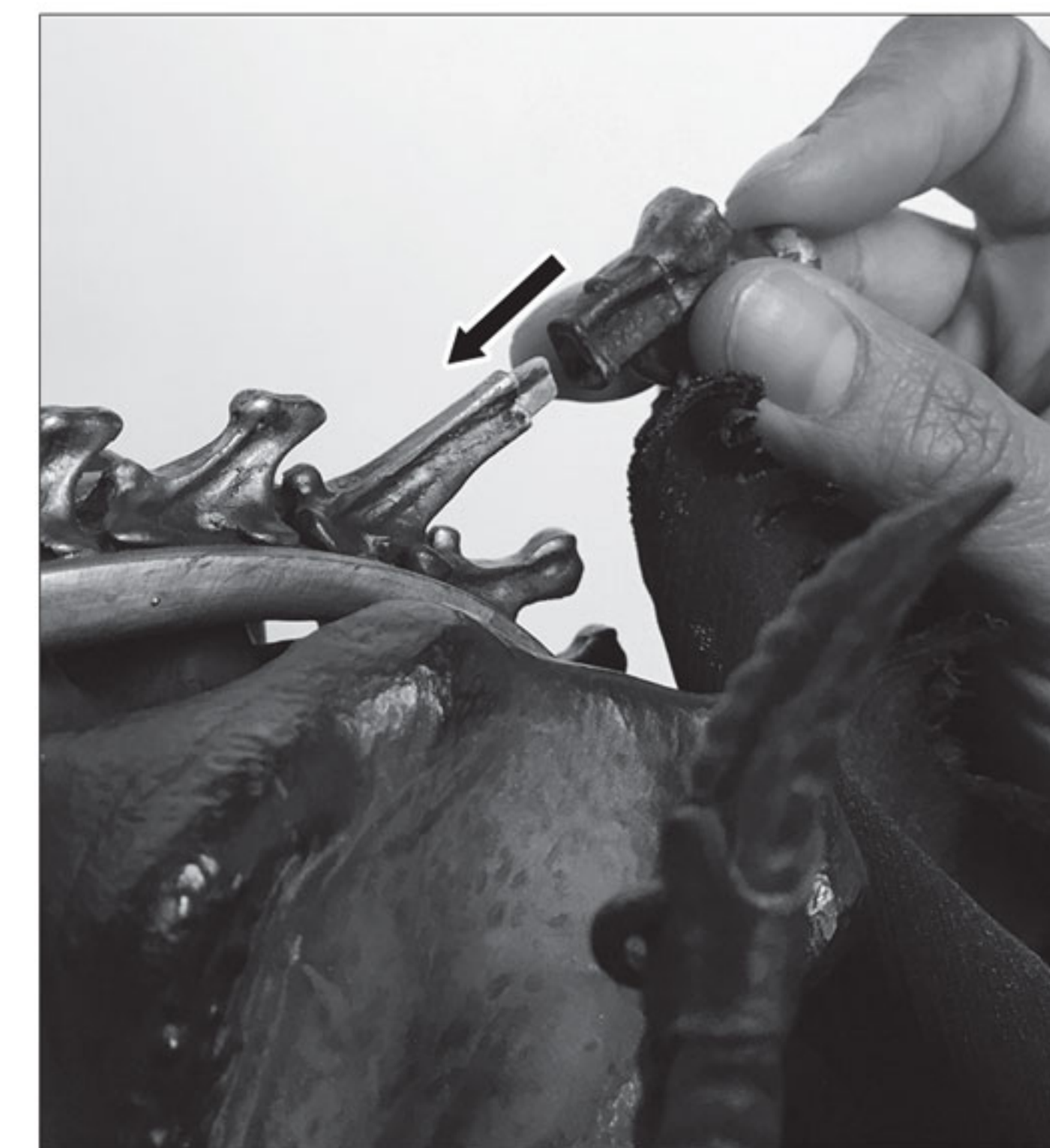
4. Take the silver center connection point on the drapery and insert it onto the designated spine point.