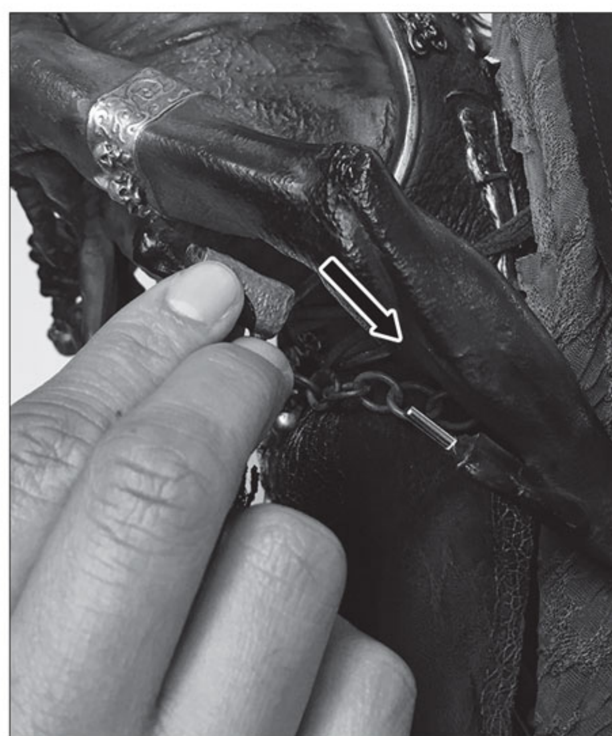
5. Put the bronze connection point on the peg located near the elbow on the left arm.