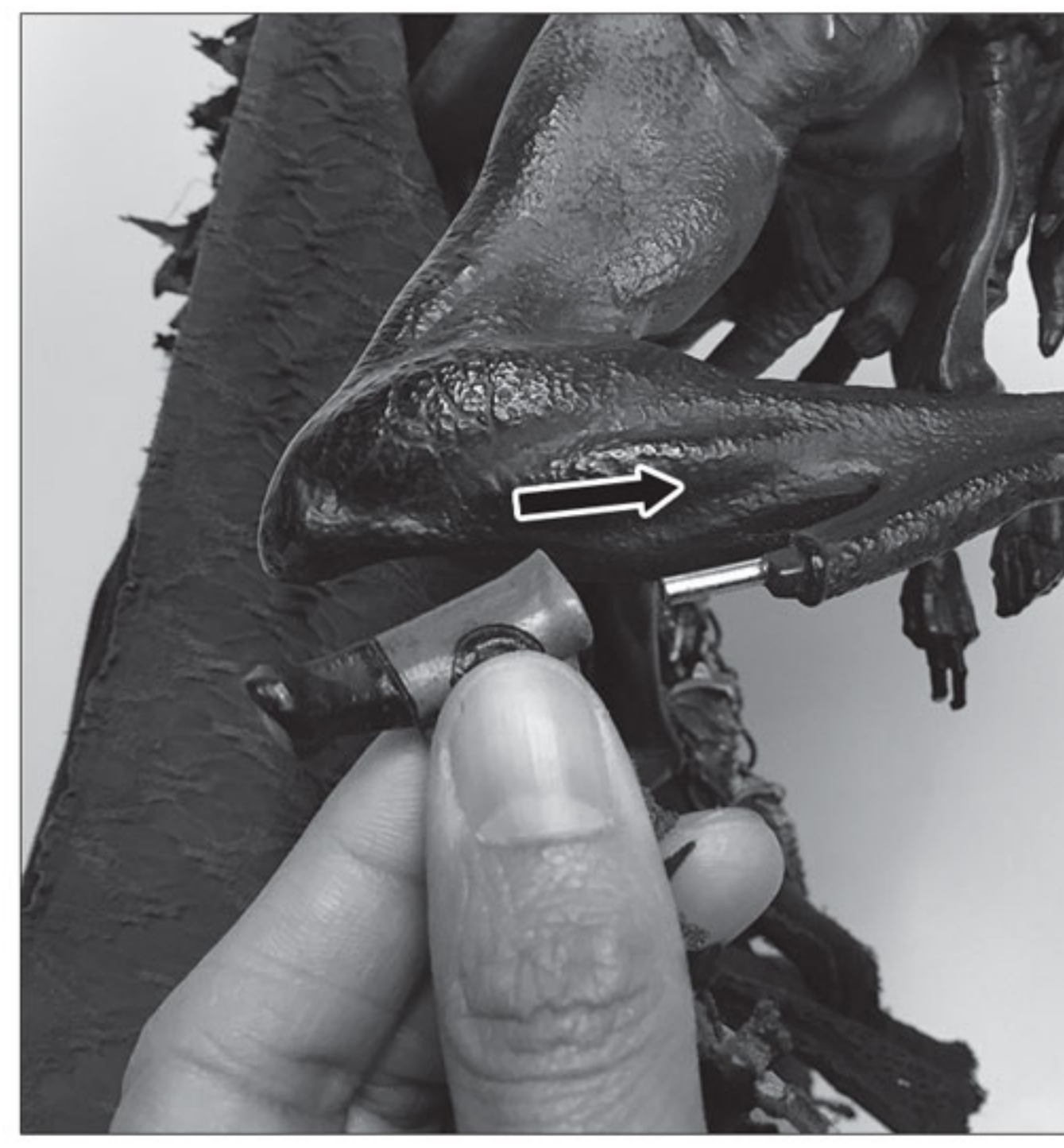
6. Do the same on the other arm.