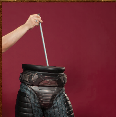
PLACE BOTH LONG BOLTS INTO WAIST SECTION