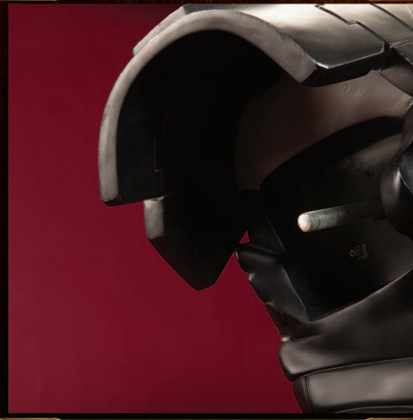
NOTICE LONG BOLT