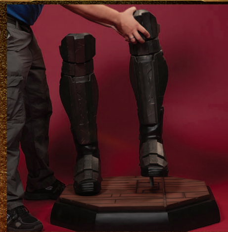
REPEAT STEP 3 WITH THE LEFT LEG