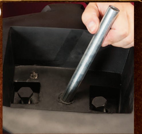
PLACE 10" TORSO PEG INTO DESIGNATED AREA WITHIN THE WAIST SECTION