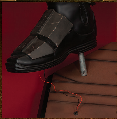
CONNECT WIRES INTO BASE FOR LIGHT UP FEATURE (CHECK FOR ANY DAMAGED WIRES/COILS)