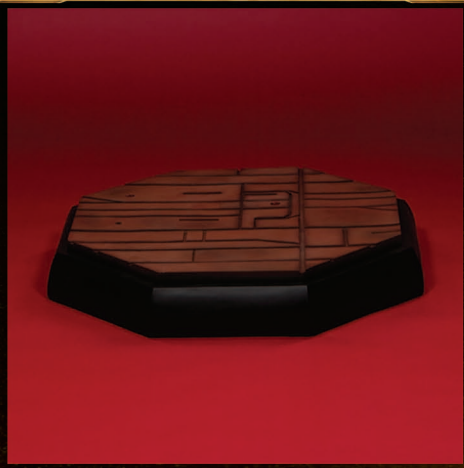
LAY BASE FLAT ON THE GROUND