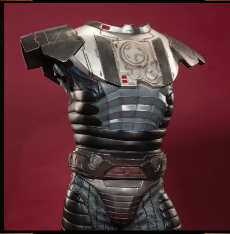
MAKE SURE UPPER TORSO IS ALIGNED WITH THE WAIST SECTION