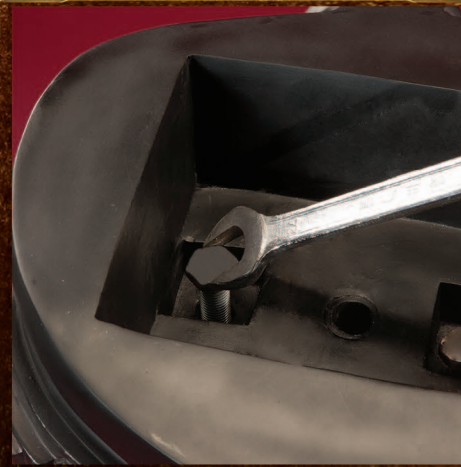
REPEAT FASTENING FOR BOTH SIDES