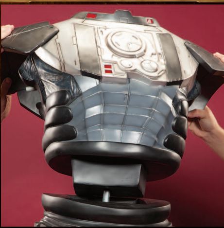
PLACE UPPER TORSO ONTO THE TORSO PEG