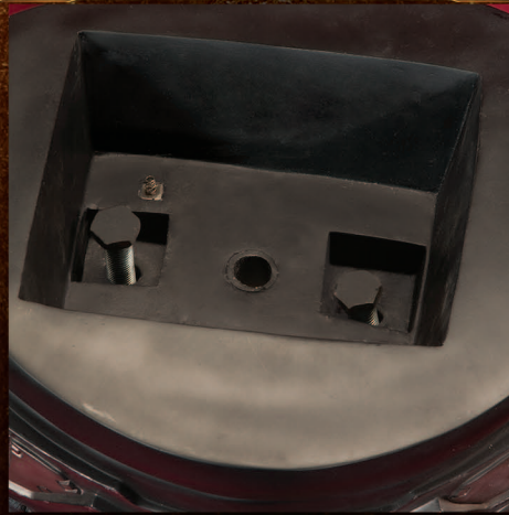
SECURE BOTH BOLTS WITHIN THE WAIST SECTION