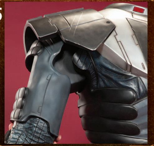
PLACE RIGHT ARM ONTO THE LONG BOLT