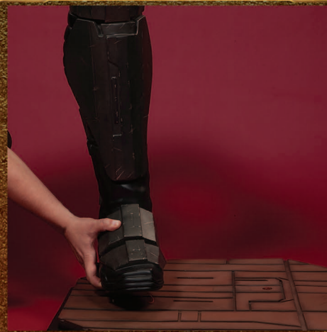
PLACE THE PEG OF THE RIGHT FOOT INTO THE PLACE HOLDER