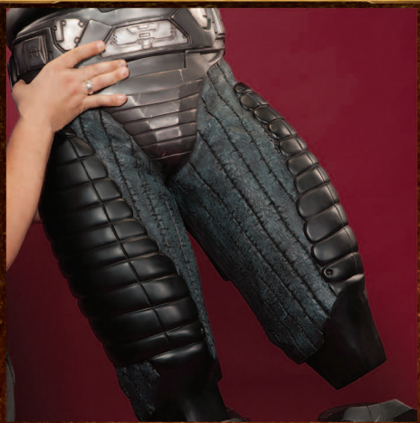
PLACE HIP AND THIGH SECTION INTO BOTH LEFT/RIGHT LEGS