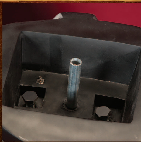
MAKE SURE ALL BOLTS/PEGS ARE SECURELY FASTENED